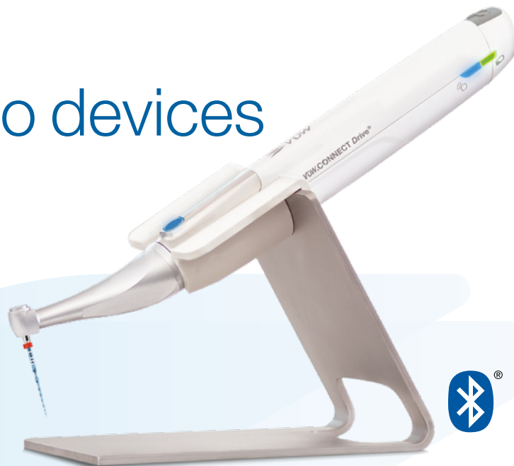
VDW.CONNECT Drive® Smart endo motor