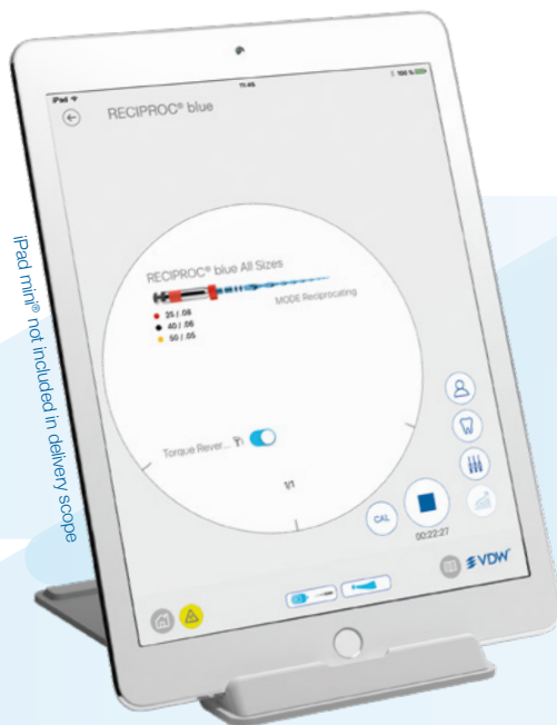
VDW.CONNECT® App Smart treatment monitoring