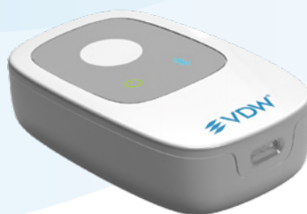
VDW.CONNECT Locate® Smart apex locator